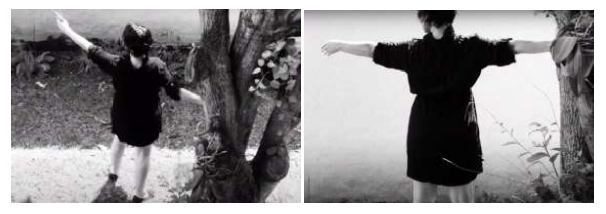
Figure 4. Contrast plongée and frontal planes.