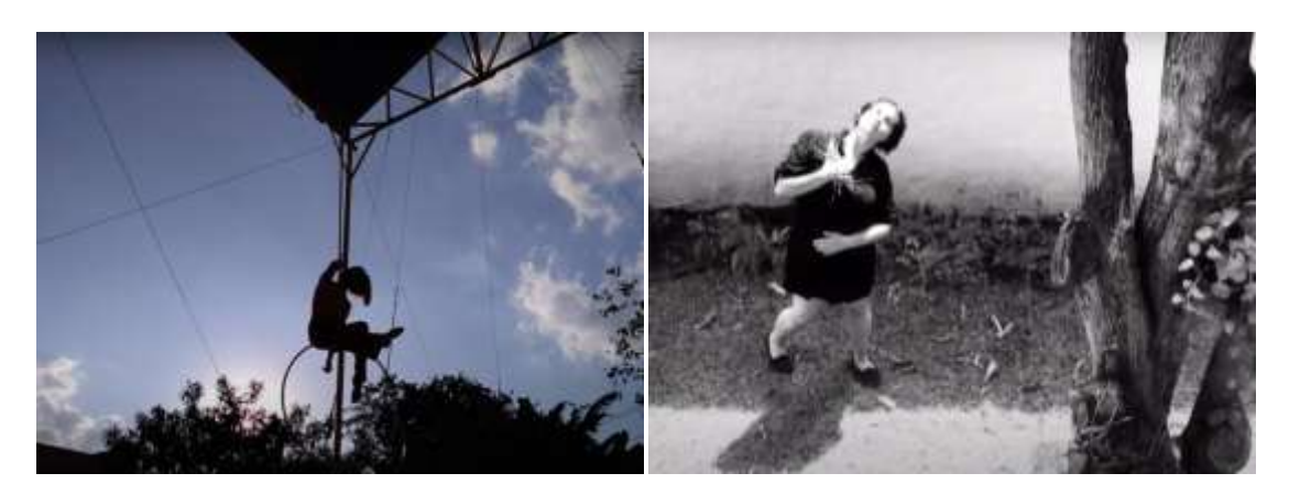
Figure 3. High-low contrast, or sky land.