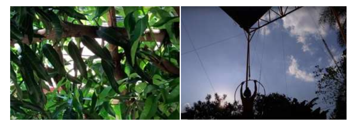
Figure 5 . Presence of trees and foliage.

Then, he developed a final creative approach concerning the interaction with sound, environment, and musical instruments.