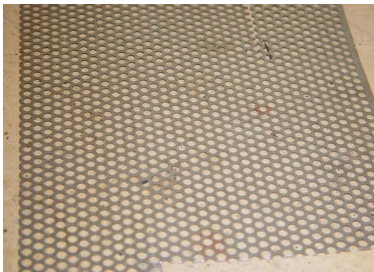
Figure 3. Porous baffle.