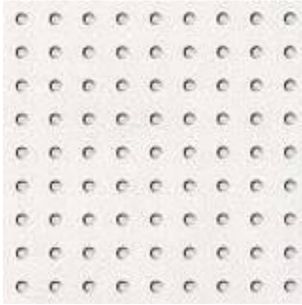
Figure 1. Perforated baffles.