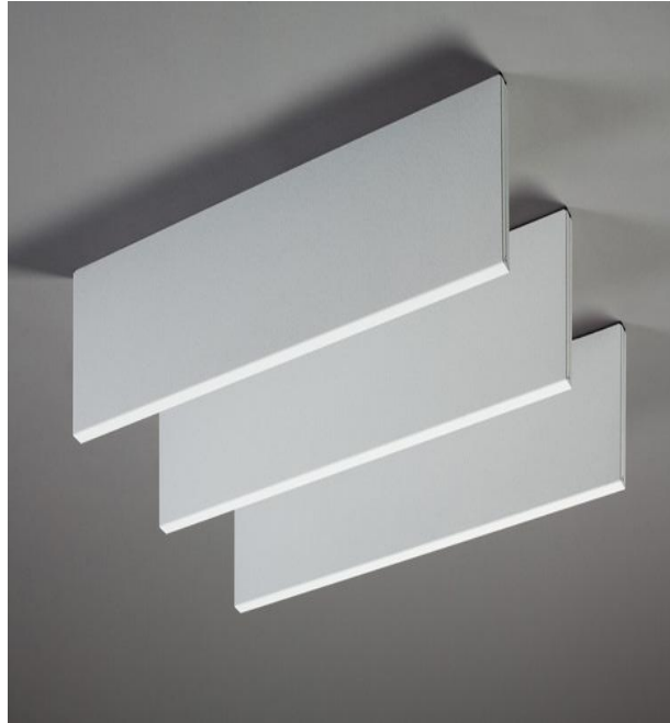
Figure 4. Solid baffles.