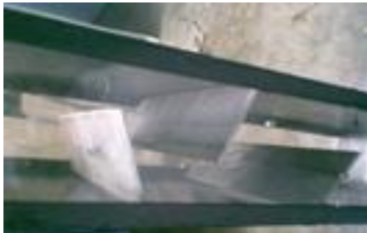
Figure 6. Baffles in rectangular duct.