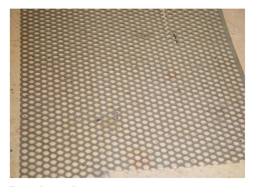
Figure 3. Porous baffle.