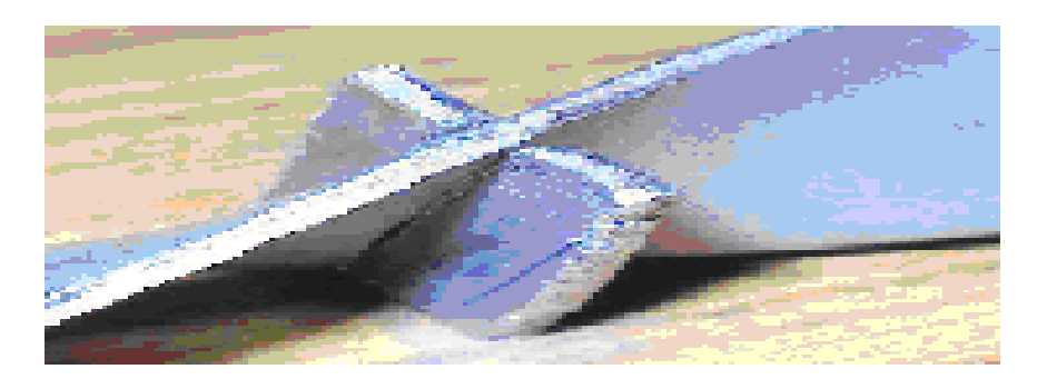
Figure 5. Tape with attached baffle.