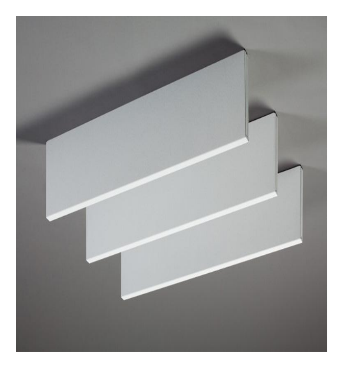
Figure 4. Solid baffles.