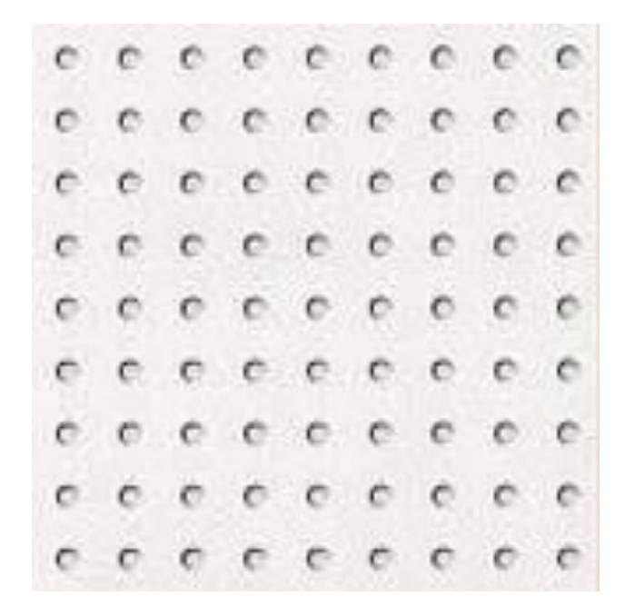
Figure 1. Perforated baffles.