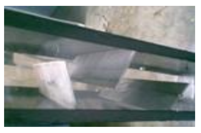
Figure 6. Baffles in rectangular duct.