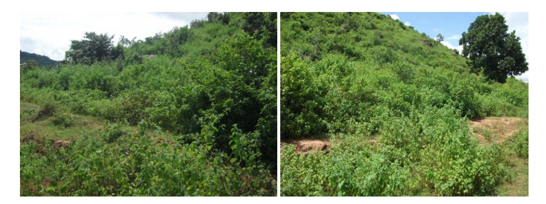
Figure 1. Tribal community.