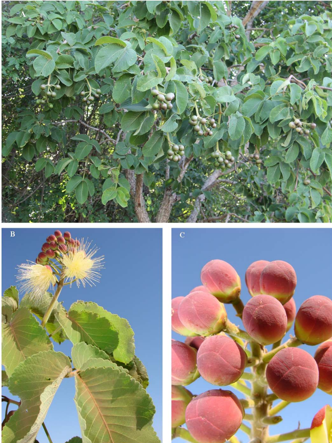
Figure 3. C. brasiliense tree top section showing branches with leaves and unripe fruits (A); branch detail with trifoliolate composite leaf and crenate margin leaflets, and open flowers with many stamens (B); details C. brasiliense flower buds (C).

According to Ferreira et al. (2011), the main fatty acids present in pequi oil are oleic, palmitic, gallic and quinine