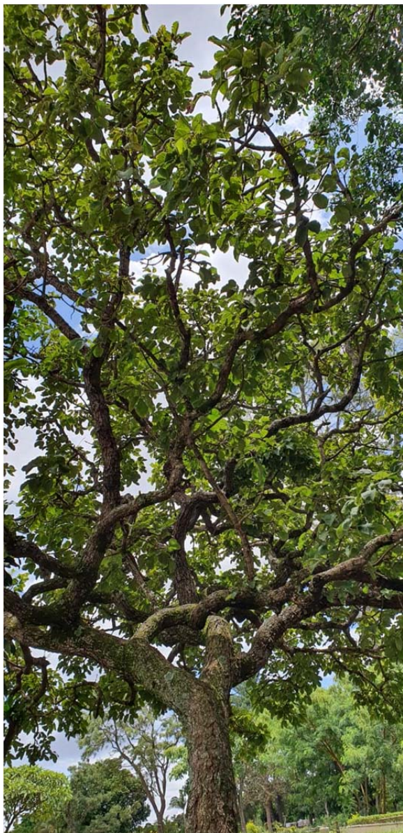
Figure 2. C. brasiliense tree, in a private area in the Midwest region of Brazil.

use of plant compounds can present toxicity and be harmful to health (Souza and Rodrigues, 2016). The objective of this work was to carry out a systematic study of scientific productions that explored the therapeutic potential of C. brasiliense , in order to summarize and harmonize the results of research in the last ten years, which sought to validate its medicinal use.