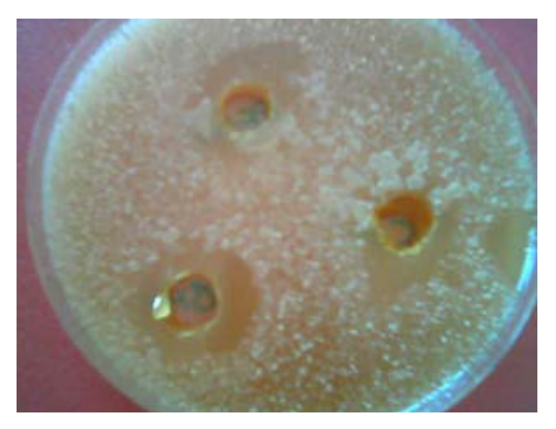
Figure 2. Zone of inhibition by ethanol extract of leaf against M. luteus .

layer of each Petri dish by a steel borer. To these cavities standard and test sample solution were added. All the work was carried out strictly under aseptic conditions for bacterial assay. The plates for bacterial assay were incubated at 37 \pm 1 °C for 18 h. The antimicrobial potential of test compound was determined on the basis of diameter of zone of inhibition around the wells (Sumitra et al., 2005, 2006).