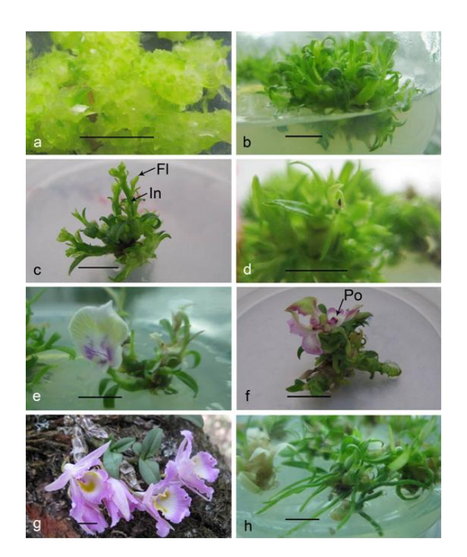
Figure 2. Micropropagation and in vitro flowering of D. wangliangii. (a) PLBs multiplication; (b) Adventitious buds; (c) The inflorescence emerged; (d) The flower without full development; (e) The flower only with the labellum fully developing; (f) The flower formed; (g) The wild flower; (h) Roots produced. FI: flower bud; In: inflorescence: Po: pollinia. Scale bar = 1 cm.

conducted, as it could promote the stem elongation. Differentiation frequency is enhanced despite the presence of browning (Table 5). It is clear that GA<sub>3</sub> increased the differentiation frequency and at the dose of 0.1 and 1 mg L<sup>-1</sup> but lowered at 2 mg L<sup>-1</sup>, while obviously promoting the number of shoots at the concentration of 1 and 2 mg L<sup>-1</sup>. With the synthetic action of 1 mg L<sup>-1</sup> GA<sub>3</sub>, 2 mg L<sup>-1</sup> BA + 0.1 mg L<sup>-1</sup> NAA, and 100 ml L<sup>-1</sup> CM, the highest buds (7.32 ± 0.17) per protocorm was achieved.