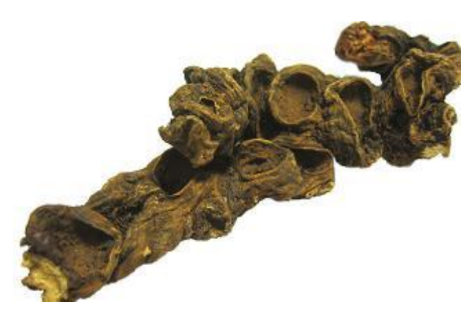
Figure 2. Dysosma versipallis rhizome (root), in Shennongjia.