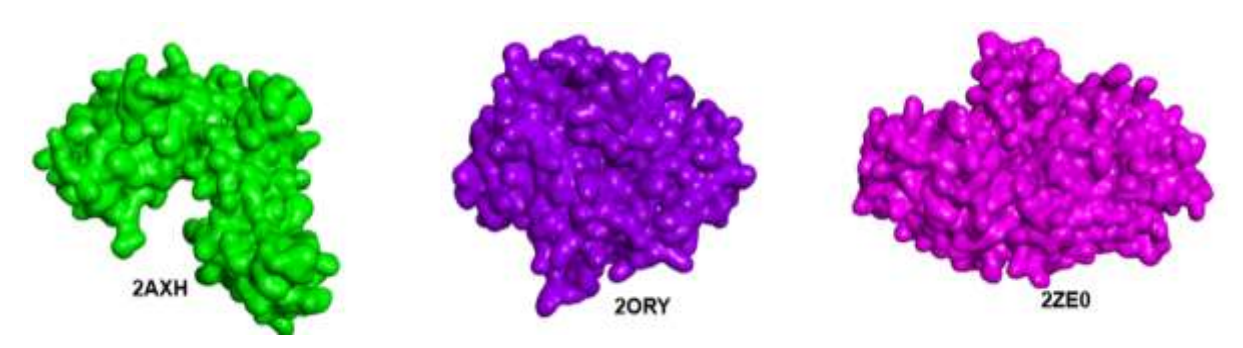
Figure 3. The 3D structure of T cell receptor beta chains (2AXH), M37 lipase (2ORY) and alpha-glucosidase (2ZE0) as visualized using Discovery Studio (www.accelrys.com) in surface models.

targeted for rheumatoid arthritis, hyperlipidemia and diabetes.