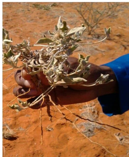
Figure 1. A. albomarginatum (A), Image credit: southafricanplants.net; A. anthelmintica (B), and D. schinzii (C) growing in the veld at Gochas, Image credit: Sunette Walter

or sinus infections. There is an interesting folk tale behind the plant's traditional use in the Kalahari to treat febrile convulsions in babies. This tale known as "Dicoma's shadow" can be read in the book "Muthi and myths from the African bush" written by Dugmore and van Wyk (2008). van Wyk (2015) explains the story in short. It is said that if the shadow of the black shouldered kite ( Elanus caeruleus ) falls on a baby, the child will get sick, and this illness will be recognized by the spastic movements of the baby's arms, similar to the movements made by the bird's feathers when it is hanging over its