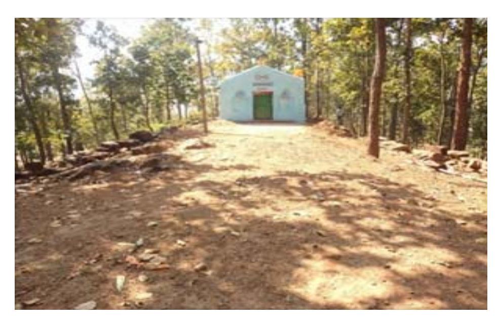
Figure 1. A view of a sacred grove in Phulbani Forest Division of Odisha.