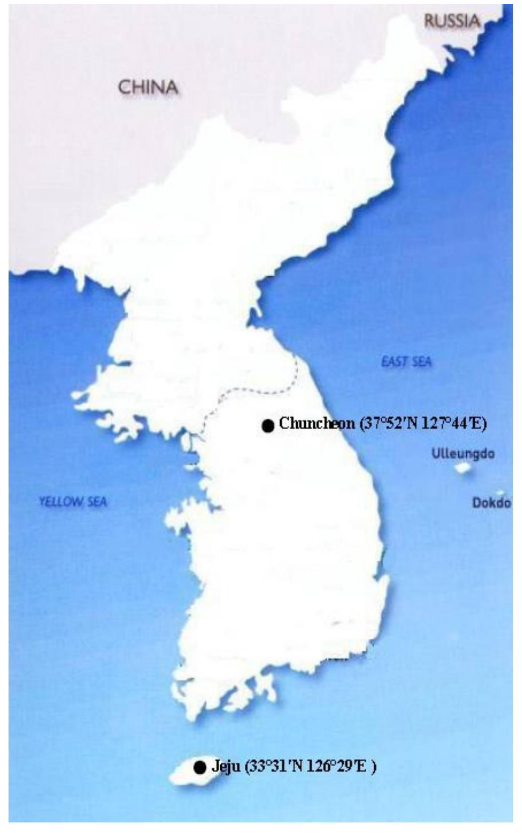
Figure 1. Map of South Korea showing collection sites of Ribes fasciculatum var. for various biological activity analyses.