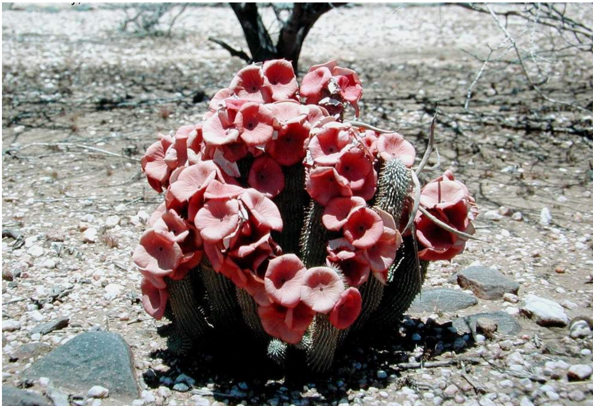
Figure 1. Hoodia gordonii (Hübner. and Tränkle, 2004).

components of the extract could not be easily removed (Bindra, 2005). According to Jasjit Bindra, head of research for hoodia at Pfizer, "surely, Hoodia has a long way to go before it can receive the approval of the North American Food and Drug Administration (FDA). Until safer formulations are developed, people Interested in the diet should avoid its use. "