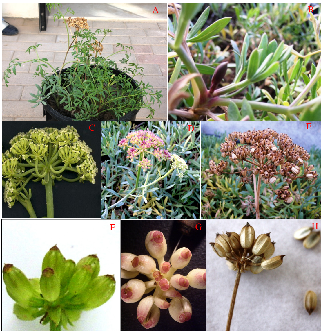
Figure 1. General aspect of C. maritimum : (A) Aspect of cultivated plant, (B) detailed view of leaves. Note the succulence aspect, (C) inflorescence aspect at the flowering stage, (D) inflorescence view after fruit formation, (E) inflorescence aspect after fruit maturation, (F) and (G) detailed view of the fruit during pre-maturation stage, (H) details view of fruit at maturation.

transfer in distilled water. This suggests that in natural conditions, the plant produces seed banks consisting in seeds that remain viable and germinate after the winter rains, so that the plant can successfully establish (Atia et al., 2011).