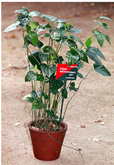
Figure 2. Piper sarmentosum plant. Adopted from http://en.wikipedia.org/wiki/Piper_sarmentosum .

morbidity, mortality and expenditures as well as reducing the quality of life. Several studies have been conducted to investigate the different medicinal plants to evaluate their healing properties in order to produce a more effective or complementary treatment for fracture healing of osteoporotic patients. PS is rich in a natural antioxidant superoxide scavenger (Naringenin) which may have beneficial in promoting fracture healing most probably by reducing ROS through its free radical-scavenging activity. Hence, PS may have potential to be added as antioxidant supplements to the current treatment modalities.