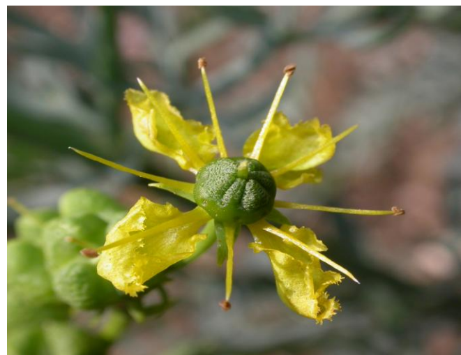
Figure 3. R. graveolens flower.

women because in high concentrations it can provoke hyperemia in the uterus and high mobility (oxytocic action) which may cause abortion. At the concentrations needed for this effect, it can cause the death of a pregnant woman. R. graveolens is rich in rutin which act as a venotonic and capillary protector. Rutin helps increase visual sharpness and benefits other visual problems, and it was used against edema, thrombogenesis, inflammation, spasms, and hypertension (Miguel, 2003). The essential oil is spasmolytic, anti-inflammatory and antihistaminic and is a vermifuge (Mansour et al. 1989). R. graveolens can also be used as a rubefacient, applied in poultices for rheumatic pain, dislocations, tendon strains, varicose veins and skin conditions such as psoriasis and eczema. It has bitter eupeptic properties, so it is prescribed for stomach and intestinal disorders. If externally spread on moist skin under direct sunlight it leads to photosensitivity, caused by furanocoumarins resulting in hyper pigmentation, swelling, itching, and even burns and blistering (Miguel, 2003).