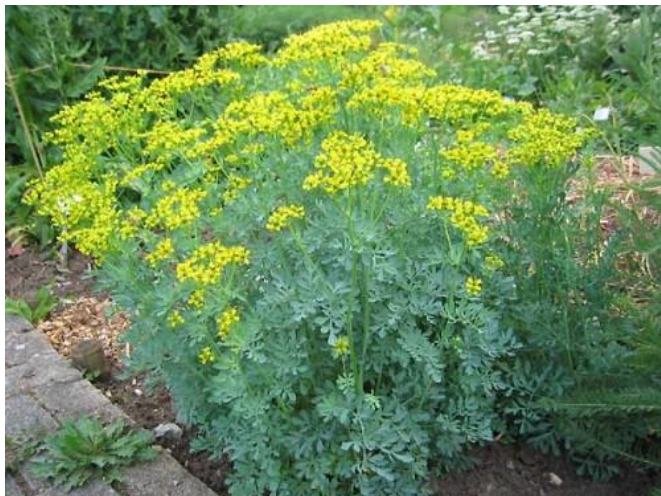
Figure 1. Ruta graveolens (Rue).