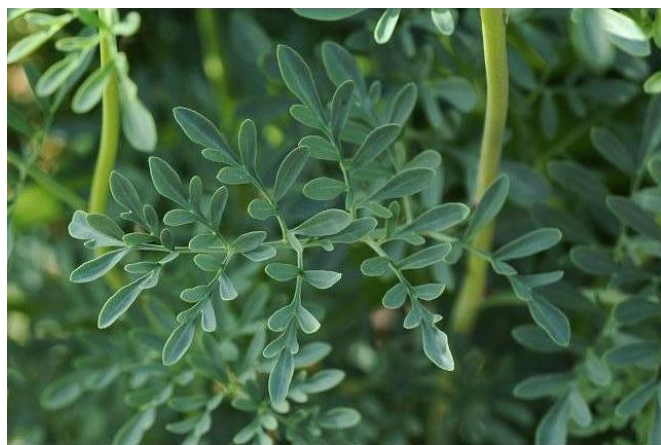
Figure 2. R. graveolens leaves.