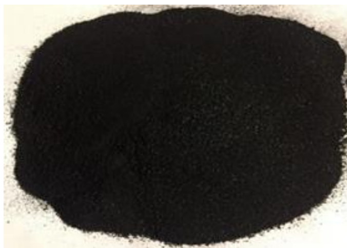
Figure 1. The physical appearance of coal char used as a soil amendment.

Data indicates the mean values (n = 3) with the associated standard errors (SE) from the means in the parenthesis.