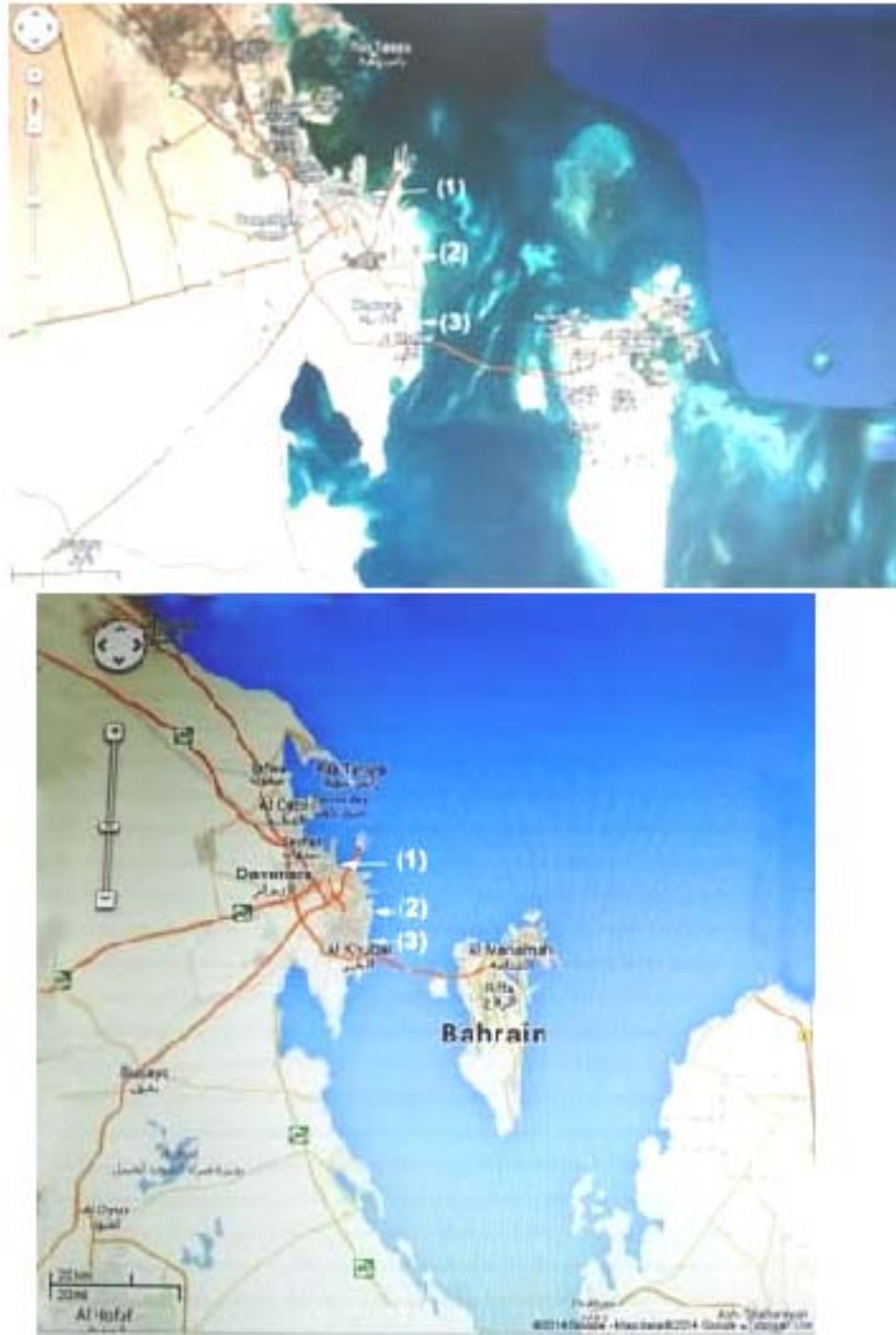
Figure 1. Google earth map and land picture showing the three study sites. (1) Ad-dammam estuarine beach. (2) North Khobar estuarine beach. (3) South Khobar estuarine beach.

spectra, the calculation of concentrations and the post-processing unit (Rindby, 1989; Perring and Blanc, 2008).