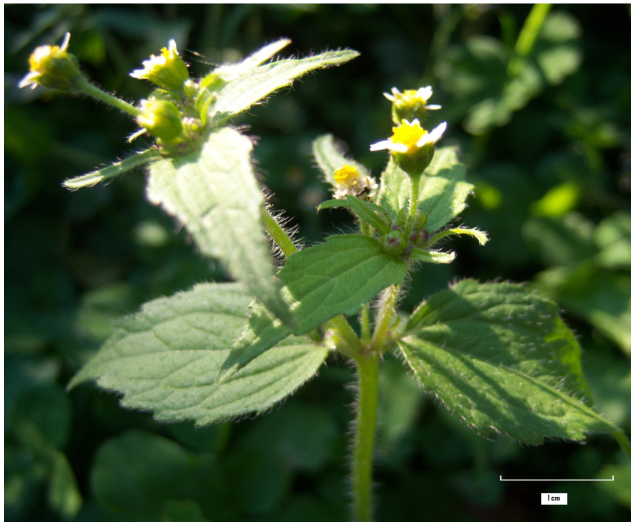
Figure 1. Galinsoga ciliata (Raf.) S.F. Blake, upper part of the plant with typical characteristics of the species. September 2008.