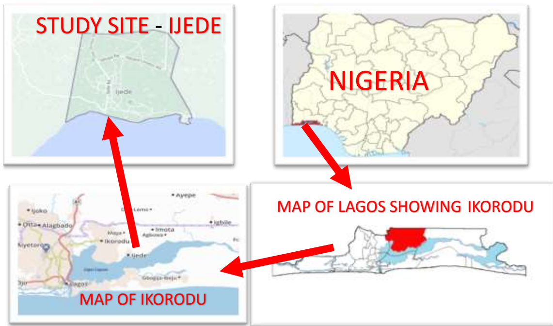
Figure 1. Map showing Ijede community, Ikorodu Local Government Area, Lagos State, Nigeria.