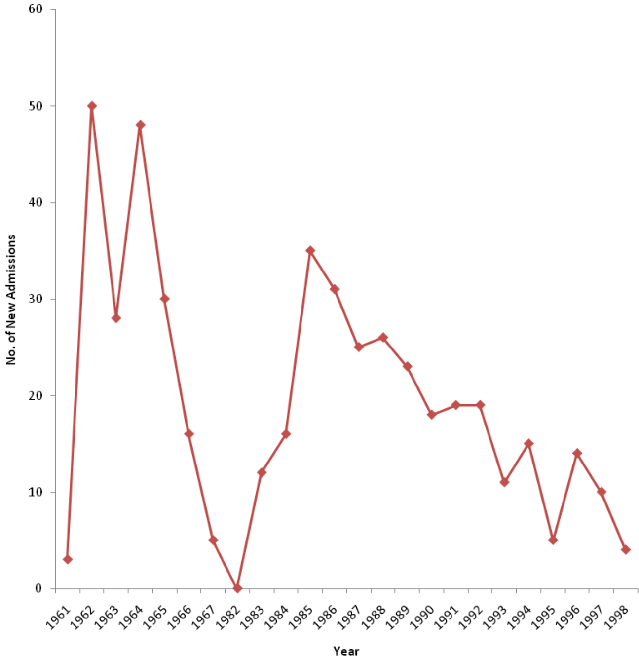
Figure 3. Secular trend of new admissions of leprosy in the study area from 1961 to 1998.

be reduced by early case detection and chemotherapy, BCG vaccination, which is widely administered as a preventive measure against tuberculosis but appears to afford more protection against leprosy than tuberculosis (Fine and Smith, 1996) and socioeconomic conditions, which are thought to play an important role in leprosy (International Leprosy Association Technical Forum, 2002). Economic improvement may result in a decline in incidence such as housing conditions, number of persons per household per room, family size and nutritional