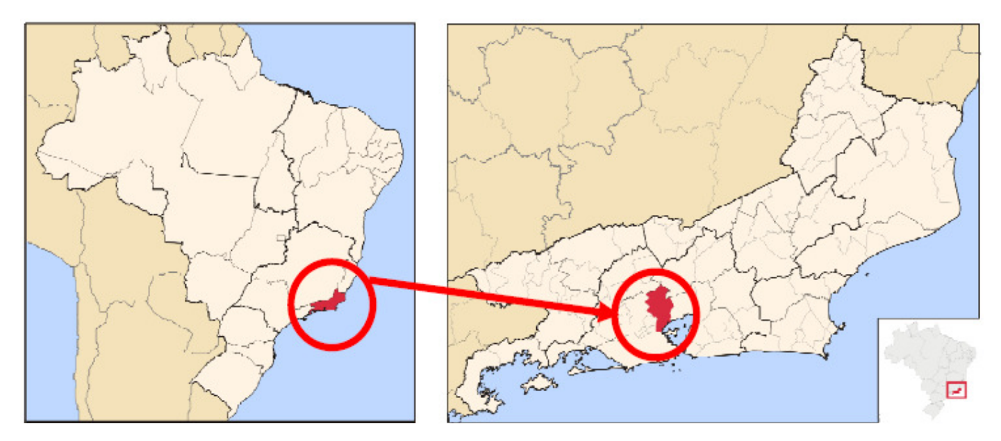
Figure 1. Gramacho's landfill localization.

Gramacho's landfill operations started as an open dump in a mangrove swamp in 1978. Initial filling was performed by pushing waste into the swamp area to fill it to a point where it was above high sea level. Subsequent fill activities consisted of haphazard dumping, waste burning, and uncontrolled scavenging. Since the beginning of the decade of 1990 it has started to receive some cares to minimize its environmental impact. In the early 1990s, the landfill operator, Companhia de Limpeza Urbana (COMLURB), began converting the open dump into a sanitary landfill. By 1996, most of the attributes of a modern sanitary landfill were in place, including controlled access, a recycling facility, well-maintained access roads, waste compaction by bulldozers, and the application of daily and intermediate cover soils. (SCS Engineers, 2005).