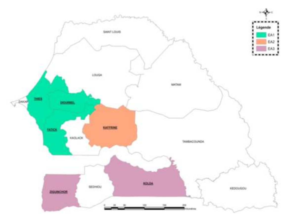
Figure 1. Map of Senegal showing the study sites. EA: Ecological area.

people and 732 million others at the risk of being infected (Chitsulo et al., 2000; Gryseels et al., 2006; Steinmann et al., 2006; WHO, 2019).