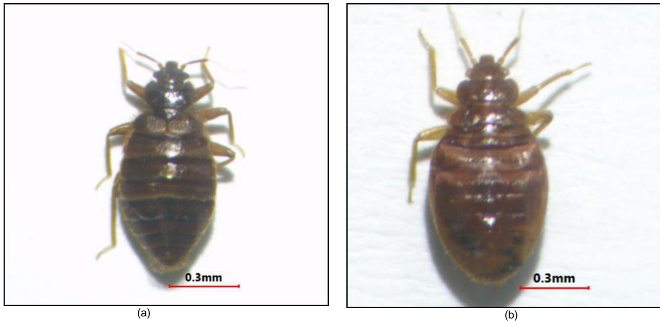
Figure 2. (a) Cimex hemipterus, (b) Cimex lectularius.