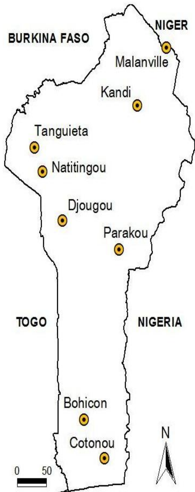
Figure 1. Map of Benin showing the shea butter samples provenances.

(Agbahungba and Depommier, 1989). Its daily consumption in this zone is estimated at 26.3 g per person (Honfo et al., 2010), and its consumption is increasing due to the high cost of imported oils. Because of the dietary importance of shea butter, it is important to analyze the quality of the butter, and assess improvements opportunities if it is necessary. The objective for this study was to assess the major microbial and physicochemical characteristics of the shea butter sold in the different urban markets in Benin.