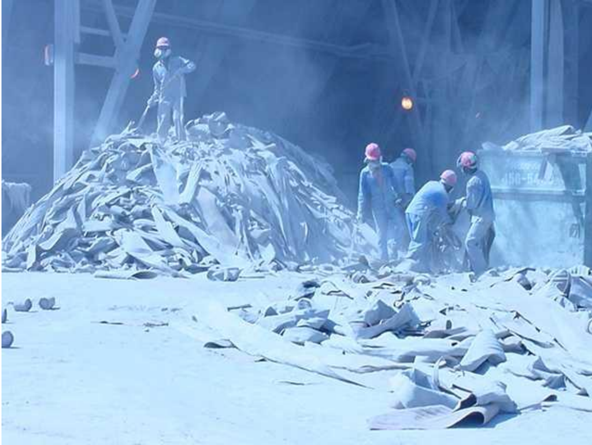
Figure 1. Fabric filter bags removed that are ready for disposal.

MCE filters were chosen for their suitability for laboratory analysis of metals by inductively coupled plasma spectrometry. Personal and static sampling was conducted for the entire shift (8 h) or at a minimum of 80% of the shift-time when bag filters were replaced in the bag house. Where only 80% of the shift time was applicable the unsampled (20%) of exposure concentration remained constant. Throughout the sampling period it was confirmed that the sampling pumps were operational for the entire sampling periods. Where problems existed with the running of pumps, sampling was terminated and then resumed with a new set of sampling equipment (normally during a next work shift). Flow rate calibration was exercised according to MDHS 51. Sampling for quartz were not conducted as the high temperature achieved during the combustion of coal changes the chemical composition and quartz is not formed. Polycyclic aromatic hydrocarbon (PAH) and silica were also not sampled as the study was limited to the workers' fly ash exposure from the combustion process.