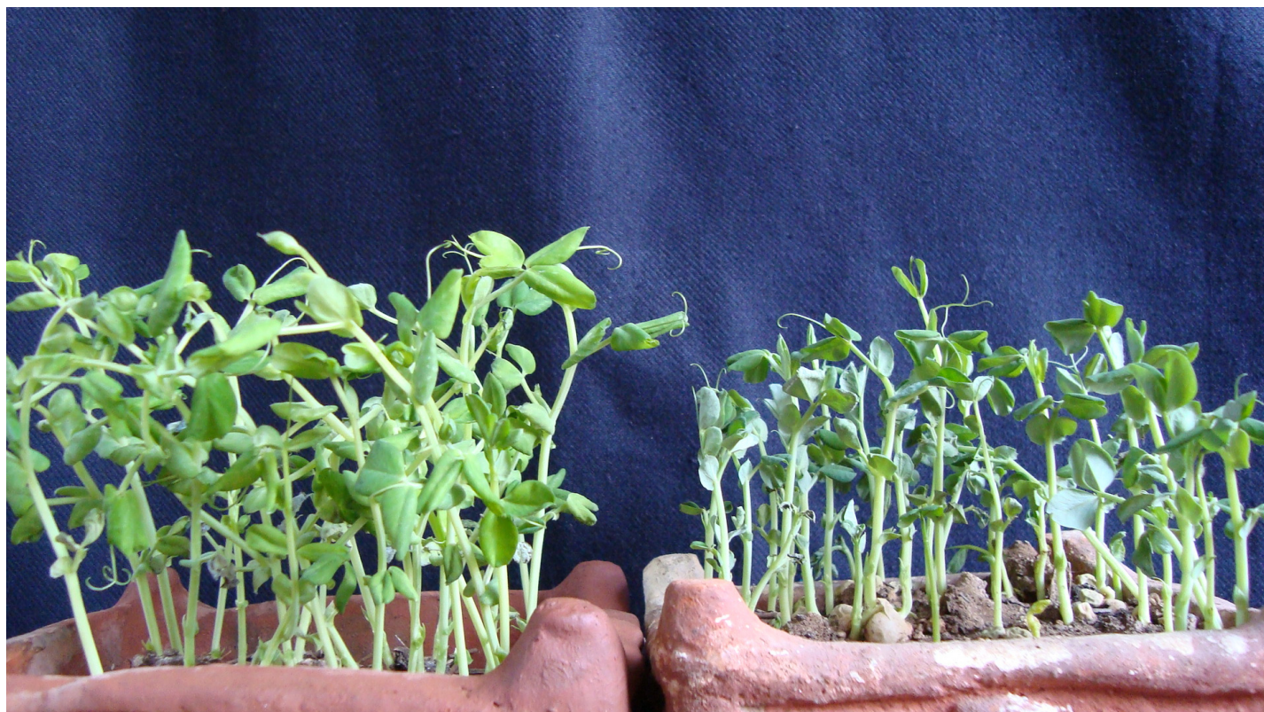
Figure 2. Treatment 5, Trichoderma (left) and Treatment 3, Fusarium + Trichoderma + Pseudomonas (right).