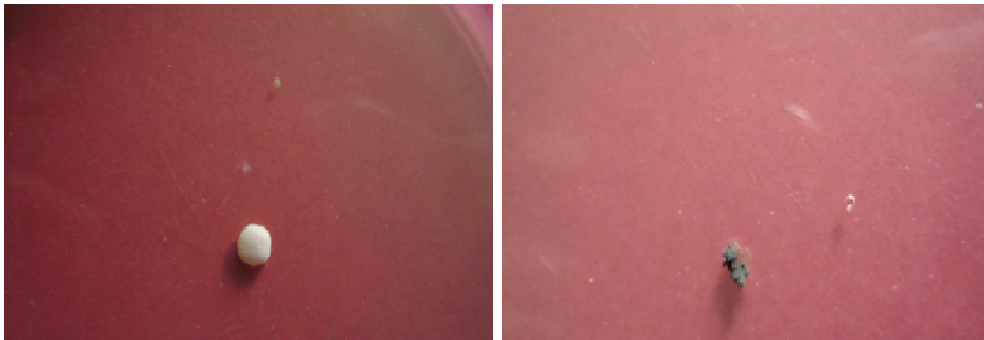
Figure 4. Very feeble growth of Fusarium (left) and Trichoderma (right) on PDA medium incorporated with 0.05 mg/ml of carbendazim.