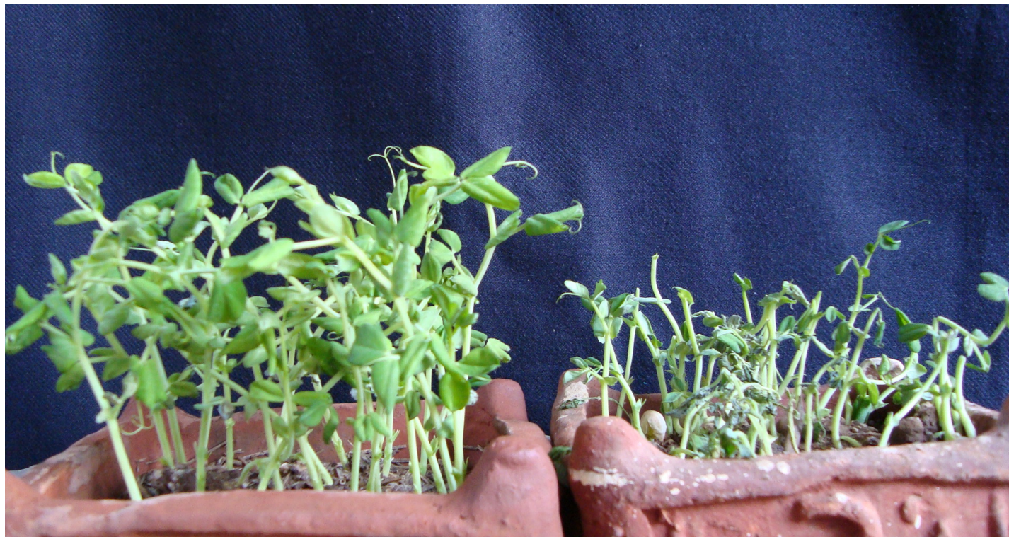
Figure 1. Treatment 5, Trichoderma (left) and Treatment 7, Fusarium (right); wilting was observed in Treatment 7 but yellowing was not prominent.