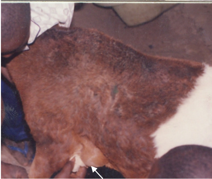
Figure 1. The abscess – Arrow pointing to the circumscribed swelling.