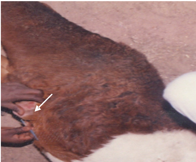
Figure 2. Abscess being infiltrated with Xylocaine before lancing.

offers answers to the major concerns being faced by mankind (Cornborough, 2002). Neem and its products have anti-fungal, anti-bacterial, anti-inflammatory, antiviral, anticancer, antidiabetic and immunomodulatory activities also have been reported to have wound healing properties (Biswas et al., 2002). This case is aimed at reporting the wound healing property/activity of crude neem oil ( A. indica ) in a field situation as there are limited reports on its use in the treatment of septic wounds.