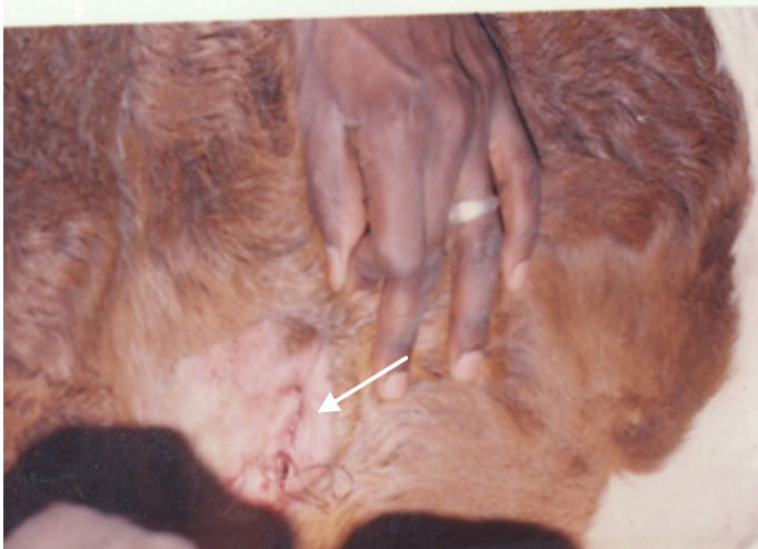
Figure 4. Stitched wound – Arrow points to the stitched area with the most ventral aspect of the wound left unstitched for continuous drainage.