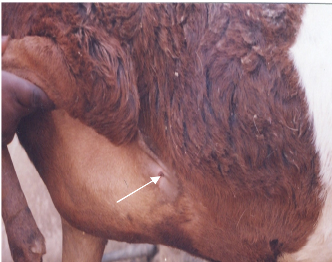
Figure 5. Healed wound – Arrow points to the scar formed after the wound has healed completely.

the seed kernel was purchased from a local processor/vendor in Gombe State, North Eastern Nigeria. A simple interrupted suture was applied to the wound using a silk non-absorbable suture (Figure 4). The most ventral aspect of the wound was left unsutured to allow for continuous drainage. Crude neem oil was then applied topically to the sutured wound. No repeat application of the neem oil was made and no antibiotic (topical or systemic) was given to the ram or applied to the wound. The animal was then monitored daily for a period of 5 days for re-infection and wound dehiscence. None was observed. Neem oil was found to be highly