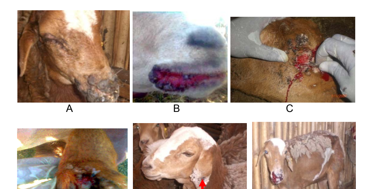
D E Figure 1. Observed clinical cases of CE virus infection in affected sheep flock at Adet Sheep Research Sub-Center, A, B and F: sheep with severe proliferative scaby and ulcerated lesions of ecthyma around the