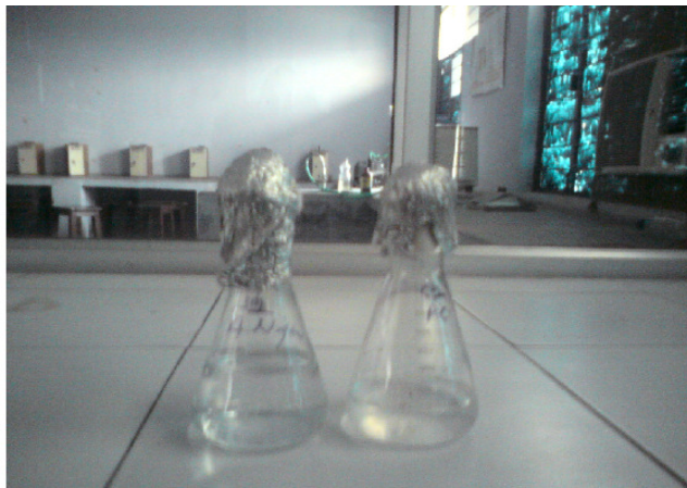
Figure 2. Culture media for A. niger and P. chrysogenum .

(3.80 g/L), H_3BO_3 ( 0.057 \times 10^{-3} g/L), MnSO_4 \cdot H_2O ( 5.5 \times 10^{-6} g/L), CuSO_4 \cdot 7H_2O ( 2.5 \times 10^{-6} g/L), ZnSO_4 \cdot 7H_2O ( 0.5 \times 10^{-3} g/L), Fe(SO_4)_3 \cdot 6H_2O ( 5 \times 10^{-6} g/L), MgSO_4 \cdot 7H_2O ( 5.5 \times 10^{-6} g/L), NH_4NO_3 (0.60 g/L), (NH_4)_6Mo_7O_{24} ( 0.025 \times 10^{-3} g/L) as shown in Figure 2.