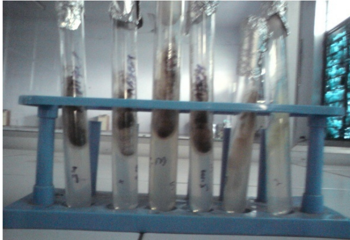
Figure 1. Pure culture of A. niger and P. chrysogenum on PDA slant