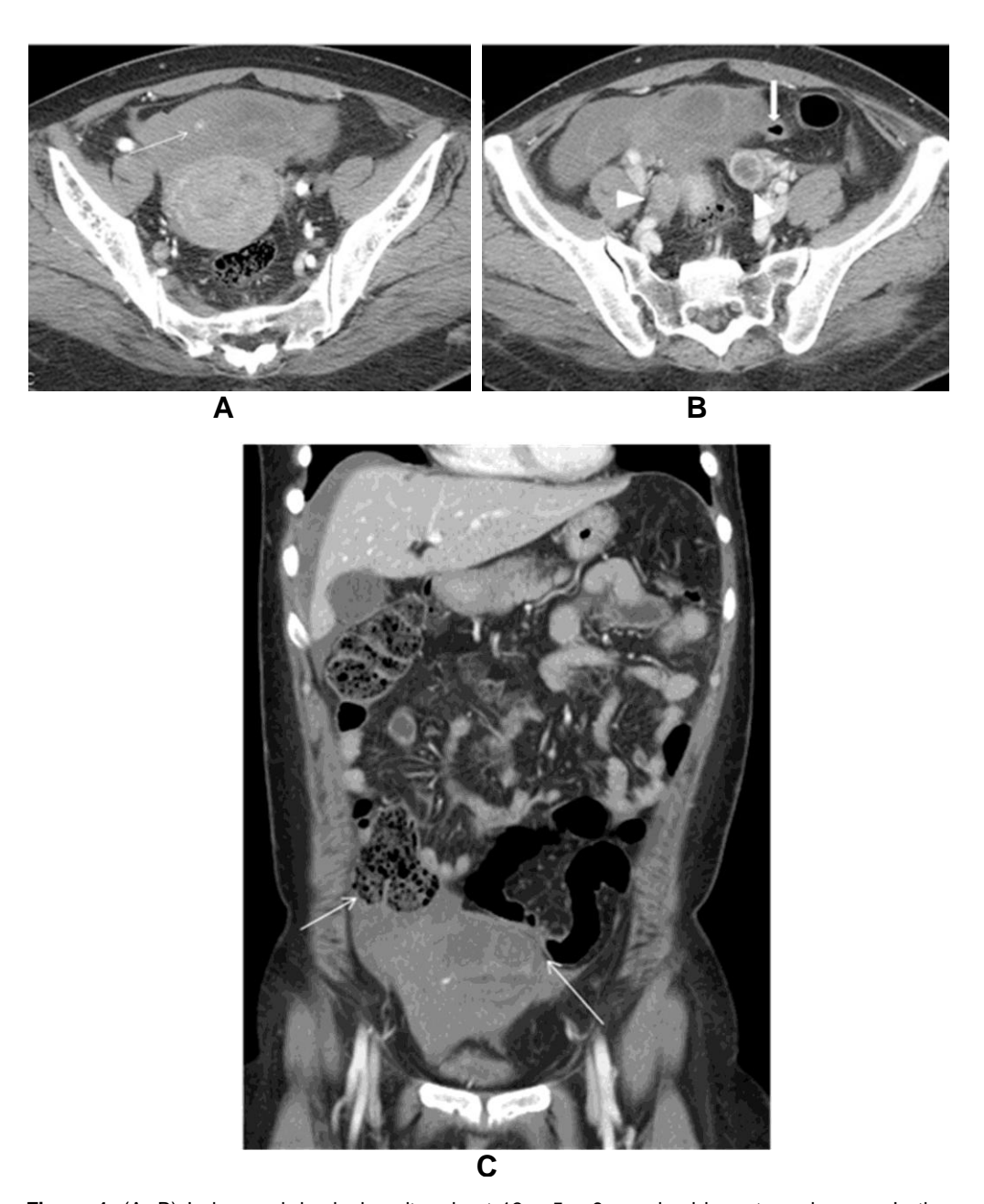
Figure 1. (A, B) In lower abdominal cavity, about 13 \times 5 \times 9 cm sized hematoma is seen. In the hematoma, multiple cystic lesions are seen with a high density spot indicating active bleeding (arrow). Both ovaries are noted on the posterior aspect of the hematoma (arrowheads). Sigmoid colon is seen on the peripheral portion of the pelvic hematoma (thick arrow). (C) Coronal reformatted image of enhanced CT scan showed pelvic hematoma with active bleeding spot. Multiple low density round lesions are also seen within the hematoma and the hematoma was abutting cecum and sigmoid colon (arrows).

noted following surgery and the patient was treated with a gonadotropin-releasing hormone agonist for 6 months.