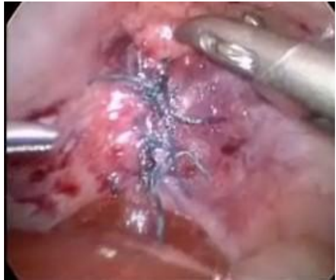
Figure 3. Intraoperative picture showing the centrally located anterior diaphragmatic hernia pre and post repair.

elective post-operative mechanical ventilation for 3 days and subsequently, extubated and discharged home in good general condition. He is now one year following surgery, well and gaining weight.