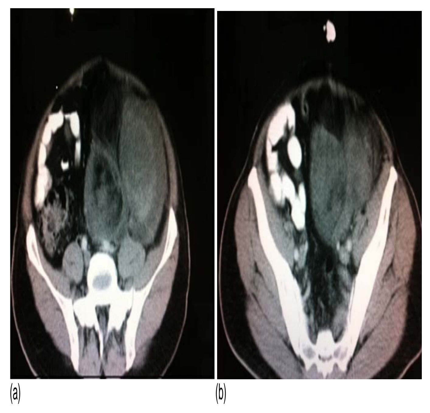
Figure 1. Computed tomography demonstrates a large mass located at retropritoneal space.

liposarcoma have been reported. Retroperitoneal liposarcomas are difficult to detect early because the symptoms of these tumors are nonspecific; the tumors can thus grow slowly in the retroperitoneal space, reaching a considerable size before being diagnosed (Inoue et al., 2005; Bradley and Caplan, 2002; Hashimoto et al., 2010). The present case was 3.000 g. Liposarcomas are histologically classified into five groups: myxoid liposarcomas, well differentiated liposarcomas, round cell (poorly differentiated myxoid liposarcomas),