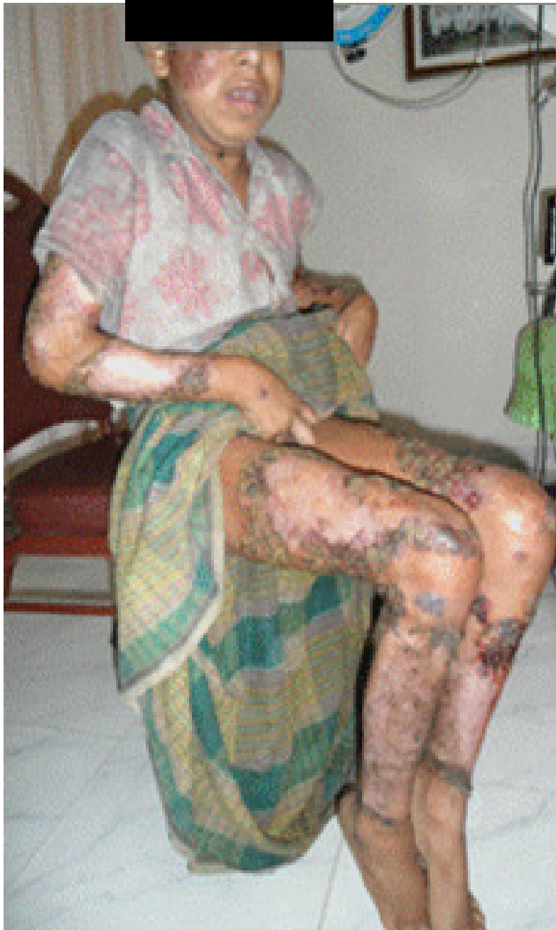
Figure 4. Showing TVC over all limb and face.

tuberculosis occurs in a previously sensitized individuals due to exogenous reinfection with M. tuberculosis and Mycobacterium bovis (Wolff and Tappeiner, 1999). The symptoms of mycobacterial infections depend mainly on the route of transmission, the pathogenicity and drug resistance of the bacteria, the immune status of the host and various local factors. Adult males are reported to be most commonly affected (Irgang, 1955), probably because they are more usually involved in heavy manual work and liable to chances of trauma infection, thus