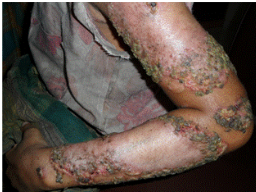
Figure 2. Showing TVC lesions over left arm and forearm.