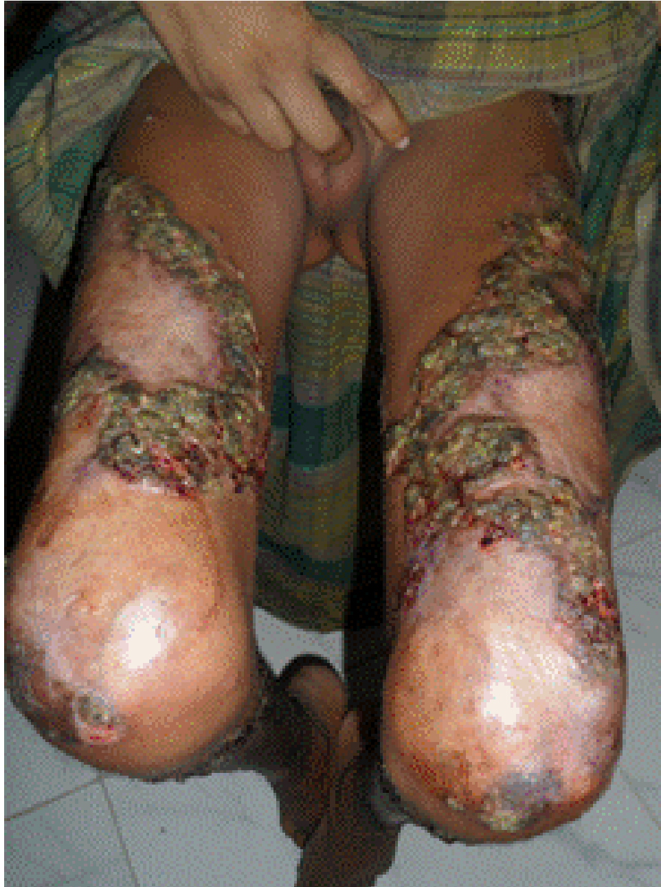
Figure 3. Showing TVC lesions over both lower limbs.

lymphadenopathy. Systemic examination did not reveal any abnormality. The mother of the boy patient gave information about family history of positive PTB association of the father. Routine blood investigations and chest radiographs were within normal limits. Mantoux test measurement indicated 17 \times 15 mm in size. Ten percent potassium hydroxide smear preparation was negative for fungus. Radiographs of the foot showed only soft-tissue swelling without bony involvement. Biopsy from the foot lesion was consistent with TVC, with marked hypertrophy of the epidermis and mid-dermal