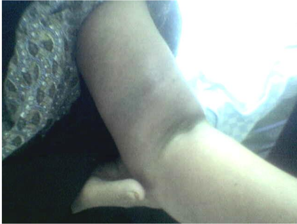
Figure 1. Edema and erythema of the patient's left arm.