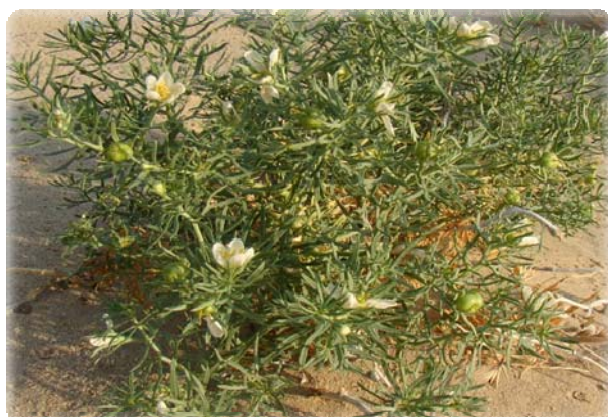
Figure 3. Harmel ( Peganum harmala ).

apparatus. After extraction, the solvent removed by means of a rotary evaporator, yielding the extracted compound. The non-soluble portion of the extracted solid remaining in the soxhlet thimble was discarded. The extracts were stored in the refrigerator under 4°C until needed for bioassay.