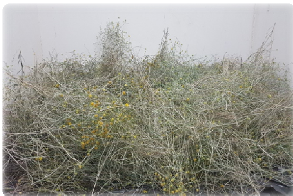
Figure 2. The Arfag ( Rhanterium epapposum ).