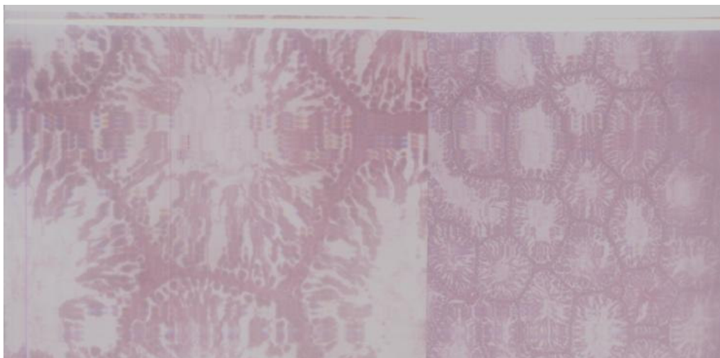
Figure 1b. Photomicrographs testicular histology of the proviron treated animals.

There are numerous regularly round shaped seminiferous tubules with a fewer elongated ones present within the testis. Moreover, most of the tubular lumens of the seminiferous tubules were filled with spermatozoa and evidence of active spermatogenic and spermiogenic activity were seen in both the X400 (right) and X100 (left) control animal slides.