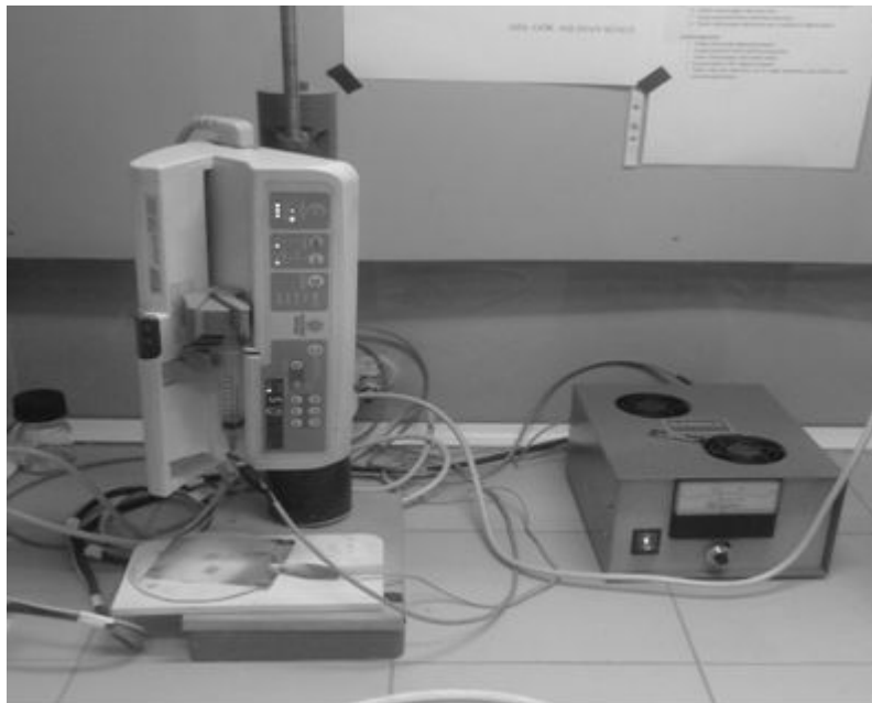
Figure 1. Experimental setup.

reaction steps: Hydrolysis and condensation of metal alkoxides (Tanrıverdi, 2006).