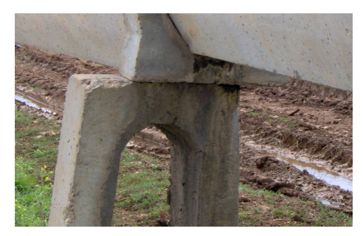
Figure 4. Sliding of supports at canalette.

When water is being taken from canals, siphons should definitely be used. Instead of siphons which, in today's conditions are quite economical, attempts are made to take in water with expensive canals, which often break