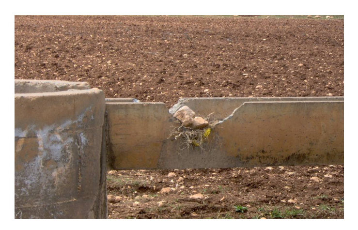
Figure 3. Taking of water by breaking the small channels.

occur in the concrete over time, decreasing the service life of the irrigation system.