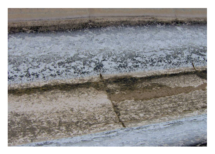
Figure 2. Oxidized and cracked concrete lining at Urfa Main canal.