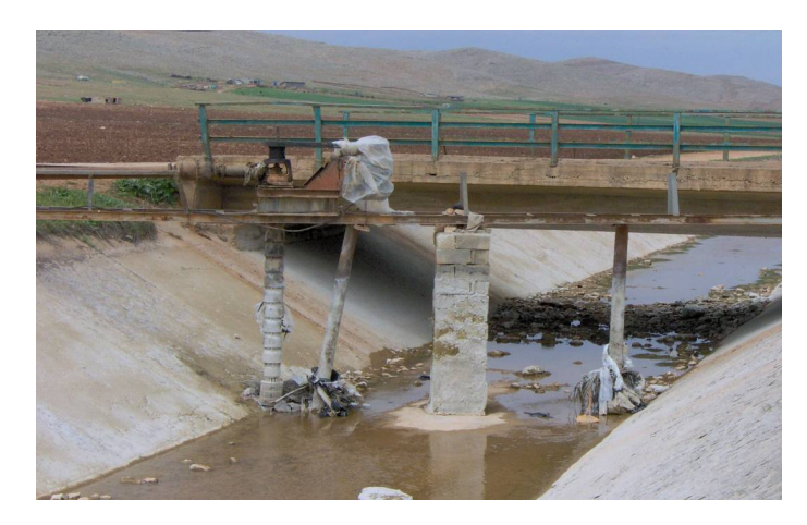
Figure 5. Unauthorized water outlet at Urfa main canal.