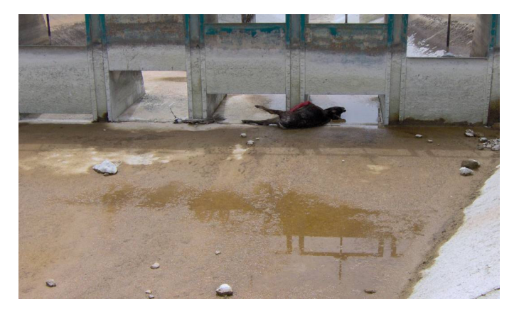
Figure 6. An animal stuck to a gate of a hydraulic structure at Urfa main canal.