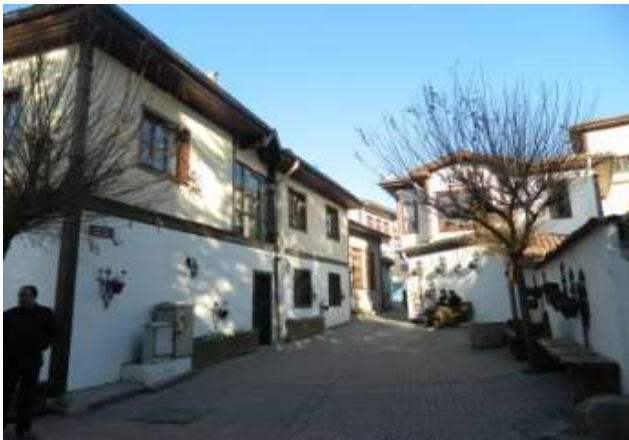
Picture 14. İnanlı Street, after restoration (Source: Writer, 2014).