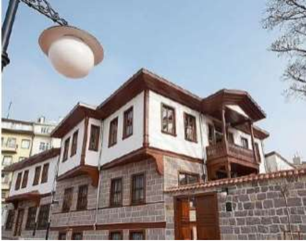
Picture 8. Beynamlızade's Mansion, current status (Source: Writer, 2014).