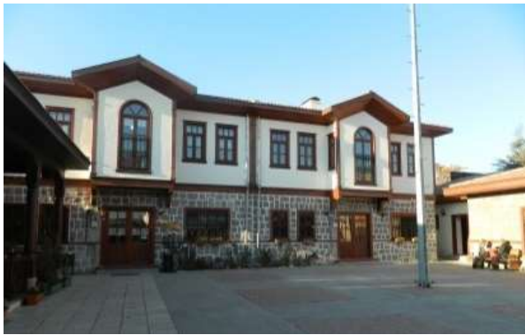
Picture 41. The courtyard of handicrafts workshop.