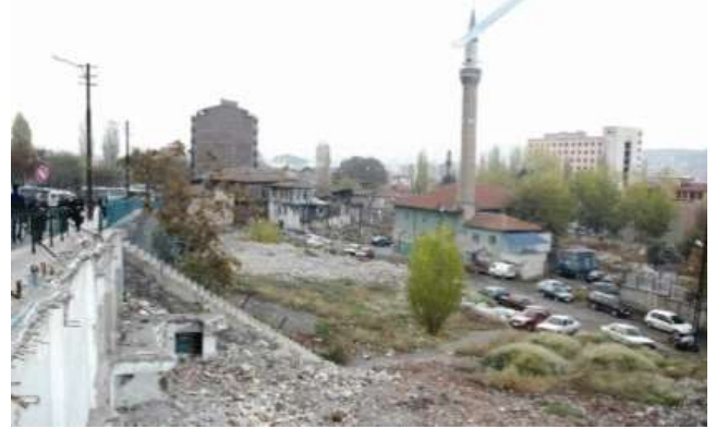
Picture 38. M. Akif Ersoy Parki, previous status.

owned single floor shops, for years (Pictures 35 and 36). The shops were demolished, the area was cleaned and arranged as a square but a clock tower was put into the