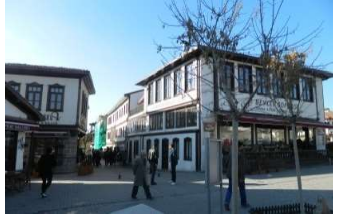
Picture 10. Hamamönü Street, after restoration.