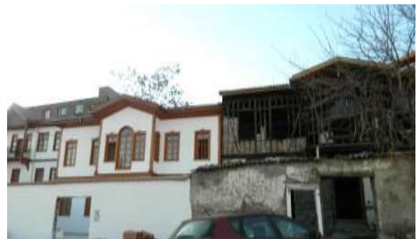
Picture 24. Gebze Street, before and after implementation (Source: Writer, 2014).

23 buildings were included in the scope of the project, of which 6 of them were officially registered at Sarıca Street. Totally 32 buildings are located on Hamamarkası and