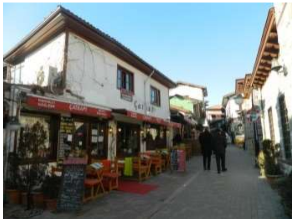
Picture 21. Sarıkadı Street, after restoration (Source: Writer, 2014).