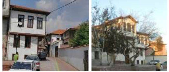
Pictures 2 & 3. İnci Street, after restoration current status (Source: Writer, 2014).

At the Development Plan for Preservation, Revitalization and Rehabilitation of Historical Urban Pattern in Ankara,