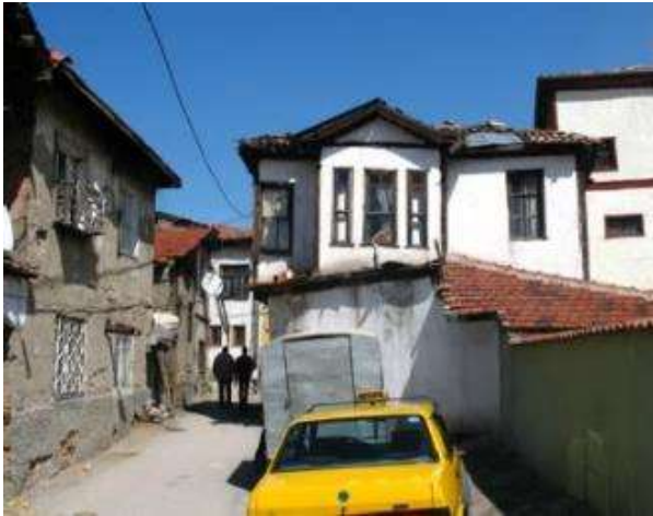
Picture 13. İnanlı Street, before restoration (Source: altındağ.bel.tr, 2014).