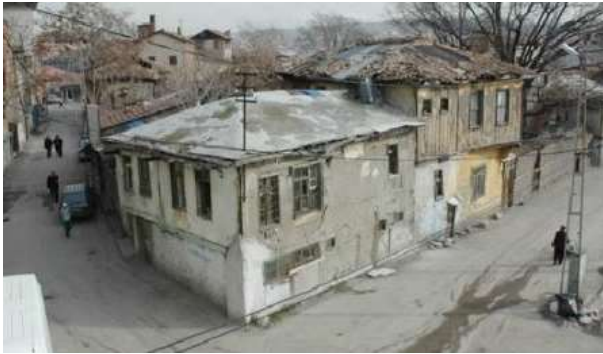
Picture 31. The house at Mehmet Akif Ersoy Street (2004).