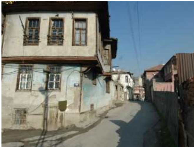
Picture 1. İnci Street, before restoration

studies, the damaged roofs were fixed with wooden construction elements in the officially registered buildings, those lost their bearing capacity were changed with the new ones, those are suitable with original details having same dimensions and cross-sections with the master pieces (Municipality of Altındağ, 2014). The pathways were rescued from asphalt and paved with floor brick, substructure was redesigned, waste water pipes, electricity and telephone lines were taken underground (Arslan, 2009: 33).