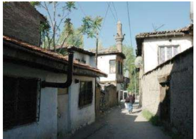
Picture 11. Fırın Street, before restoration (Source: altındag.bel.tr, 2014).

Atpazarı and Can Streets, which are the main roads to the Ankara Castle, function as the only antique bazaar in