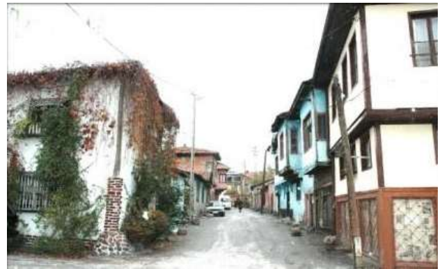
Picture 4. Dutlu Street, before restoration (Source: altindag.bel.tr, 2014).