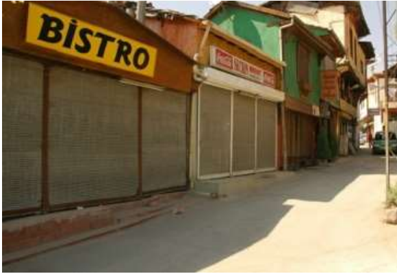
Picture 20. Sarıkadı Street, before restoration (Source: altındag.bel.tr, 2014).