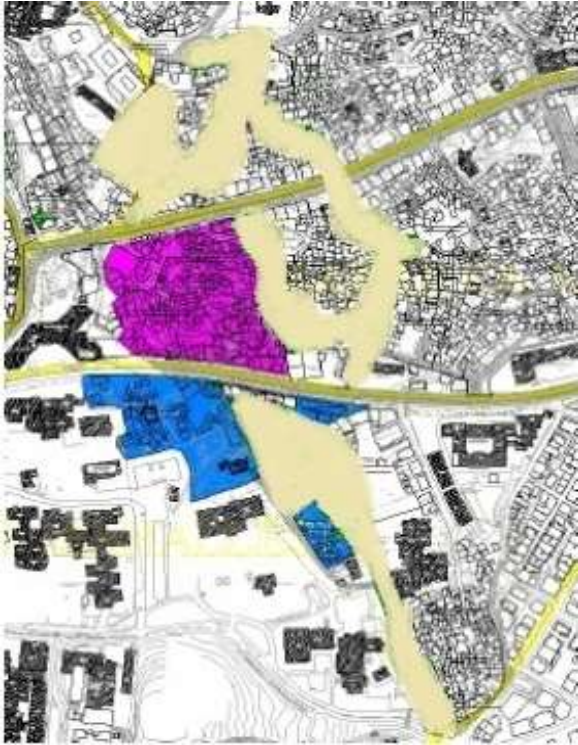
Figure 1. Types of Intervention (Source: Municipality of Altındağ, 2014).

inner spaces of houses were changed, face-lifting was made at facades, also seen some extensions and illegal additional stories due to the needs and a lot of original buildings were demolished before restoration (Kurtar, 2012).