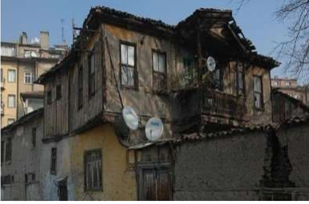
Picture 7. Beynamlızade's Mansion, before restoration (Source: altındag.bel.tr, 2014).