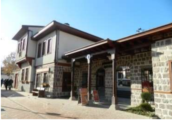
Picture 40. Sanat Street buildings reconstructed with infill technique.