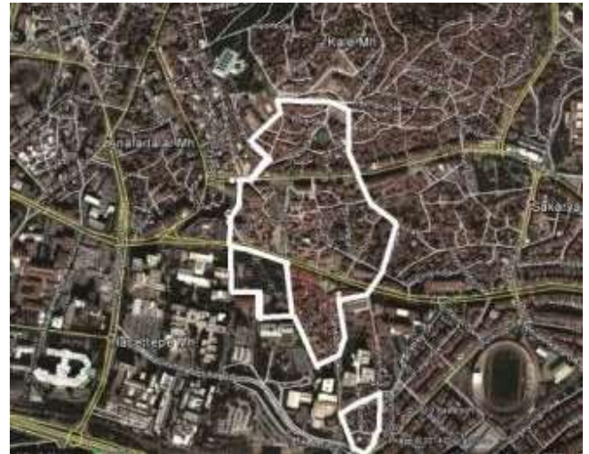
Figure 2. Aerial view of study area.

Hamamönü Urban Preservation Project, which was deemed worthy of “Golden Apple World Tourism Oscar Award” and “The Project and Application Award of Union of Historical Towns” in 2012, consists of urban transformation interventions applied such as rehabilitation, revitalization and reconstructions at single houses (Figure 1). Rehabilitation means getting old city pattern with insufficient infrastructure to sufficient status with partial renewals (Ataöv and Osmay, 2007). Revitalization is defined as, “To provide regaining vitalization of historical city centers, which lost their popularity, via taking social precautions (Şahin, 2003). During rehabilitation, Face-Lifting was applied to houses which did not have static problems, meant handling only facades of them. If necessary, infill was made in order to accord with present pattern. In the content of reconstructions, demolishing and rebuilding actions were performed, incomptaible with preservation principles.