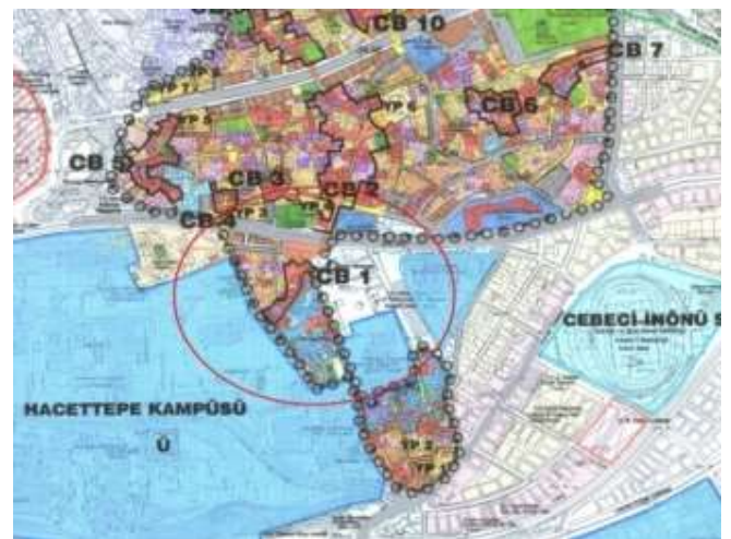
Figure 3. Revitalization areas.