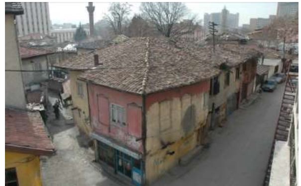
Picture 33. The house at Hamamönü Street, before restoration.

Municipality at 2006, were applied only to facades of buildings in the context of rehabilitation project at the beginning. After the year 2009, it was seen that, projects were applied through expropriation, demolishing, and reconstruction, instead building the structure afresh (Altındağ Municipality, 2014; Arslan, 2012).