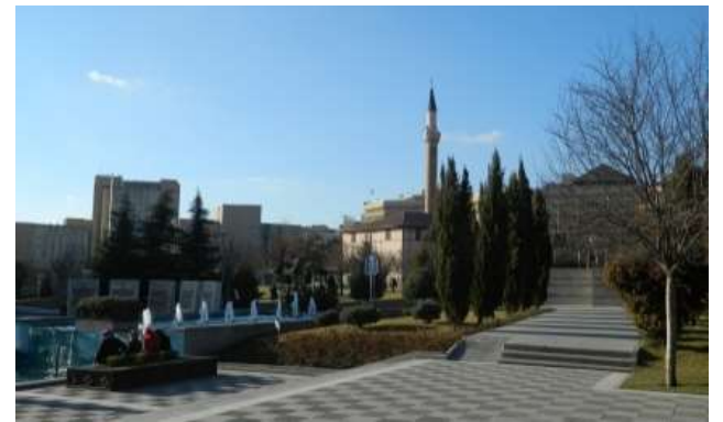
Picture 39. M. Akif Ersoy Parki, current status.

middle of the square as a street furniture which didn't exist in the original form (Picture 37) (Kale, 2011; Arslan, 2012).