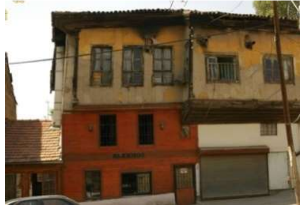
Picture 22. Sarıkadı Street, before restoration.