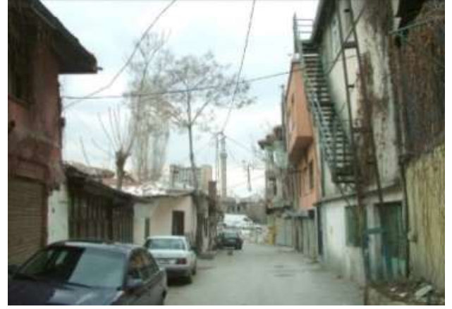
Picture 9. Hamamönü Street, before restoration.