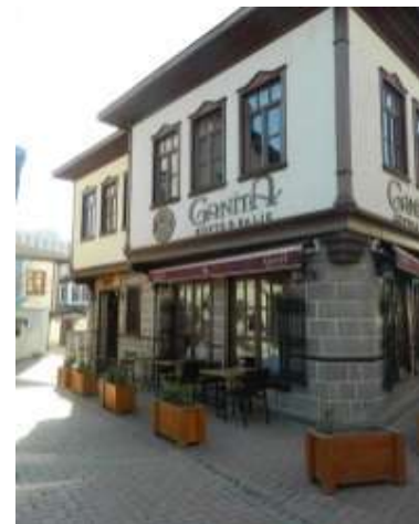
Picture 34. The facade of the house after restoration (Source: Writer, 2014).

Hamamönü Square Project: The historical square known as fair grounds, had been invaded by municipality