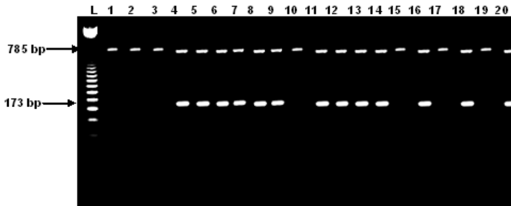
Figure 1. Genetic polymorphism APOE4 in patients. Key: Ladder- 50 bp ladder marker; Lanes: 1, 2, 3, 10, 15, 17, 19 (No Polymorphism); Lanes: 4, 5, 6, 7, 8, 9, 11, 12, 13, 14, 16, 18, 20 ( APOE4 Polymorphism).